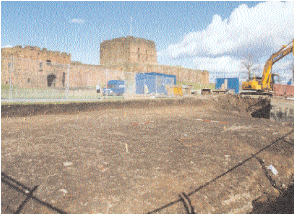
Just getting started a JCB removes the top soil before archaeologists move in.