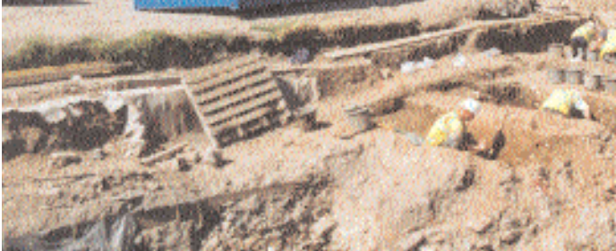
Removing a stone column base which was part of the colonnaded portico in front of the HQ building of the stone fort.